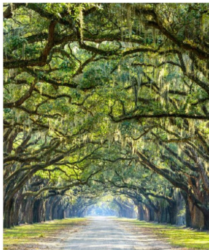
SOUTHERN CHARM—APRIL 5-11, 2027

MAUMEE SENIOR CENTER, 2430 S. DETROIT AVE., MAUMEE