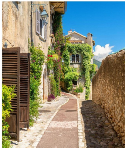
FRENCH RIVIERA—SEPT. 9-17, 2027