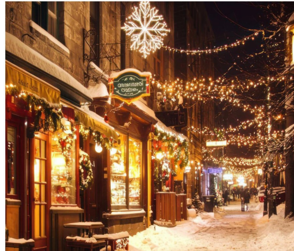
CHRISTMAS MARKETS IN CANADA—DEC. 15-21, 2027

LEARN ALL OF THE DETAILS ABOUT THESE TRIPS BY ATTENDING THE TRAVEL PREVIEW!